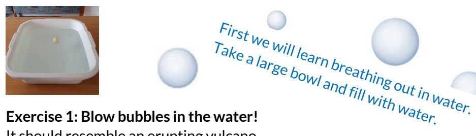
Exercise 1: Blow bubbles in the water! It should resemble an erupting vulcano.

Exercise 2: Take a straw, place in the water and blow!